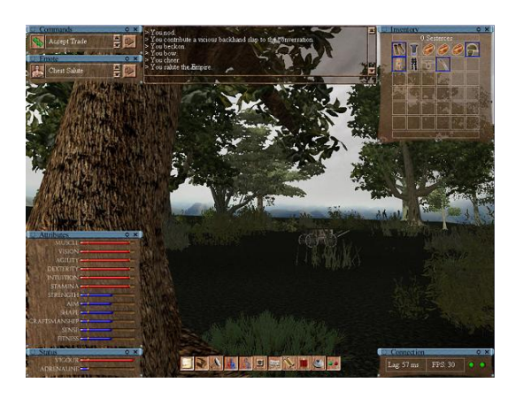
Figure 1. Original MMOG screenshot.