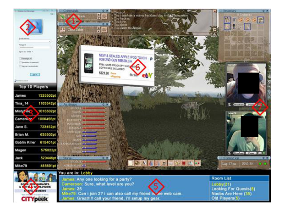
Figure 2. IGIT-modified MMOG screenshot.

advertisement; (5) MMOG specific chat to enable the users in a specific scene to cooperate; (6) In-game 3D UGC. In this example, a user added a note on a tree to publish an eBay auction; (7) two windows of a video chat with casual friends or cooperative players. The choices of which application to use and the applications' screen location are under the control of the user (player).