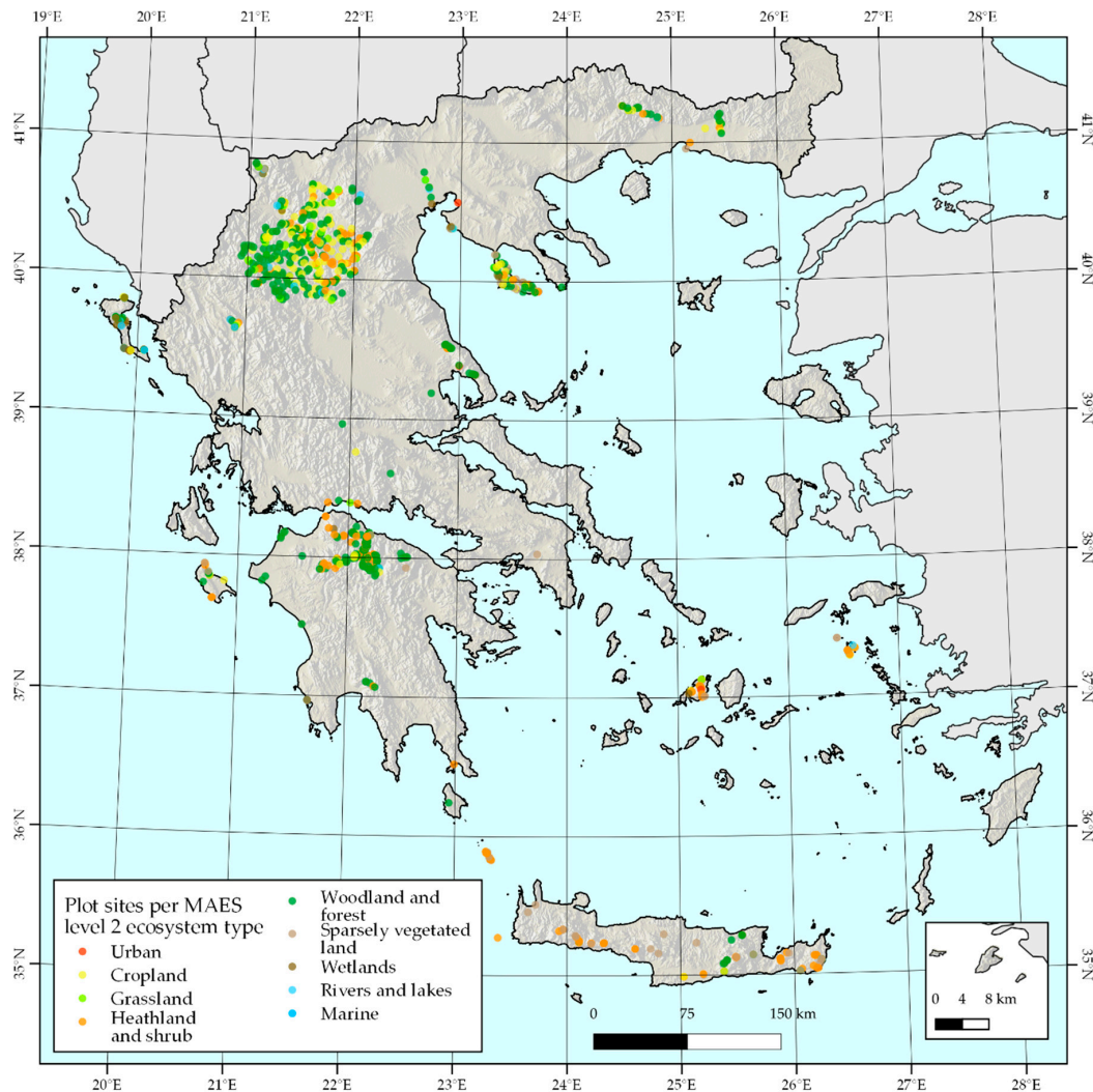
Figure 3. Field-survey plots per MAES level 2 ecosystem type.