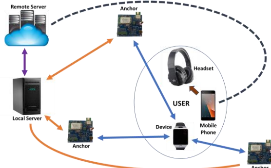
Figure 1. Overview of the proposed architecture.

In this project, the main components are a small wearable that helps in the user's positioning through Ultra-Wide Band (UWB) technology. This technology provides very accurate positioning, up to 10 cm divergence. The system, apart from the ability to locate the user, has the ability to provide guidance via voice commands.