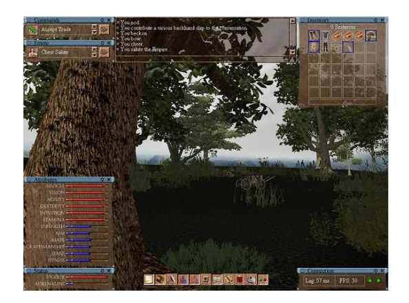
Figure 2. Original MMOG screenshot.