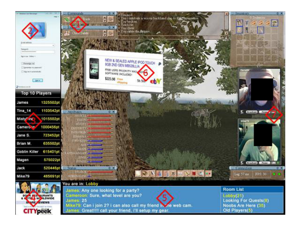
Figure 3. IGIT-modified MMOG screenshot.