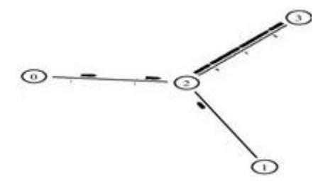
Figure 2: Sample Topology.

In this section we illustrate an example usage of TRAFIL where we open a new trace file and present the information that the tool can extract. The scenario that was used to create the sample trace file involved 4 nodes connected in the topology shown in Figure 2. The simulation lasted 80 seconds and the communication was between nodes 0-3 and nodes 1-3. This scenario is a small one and its sole purpose is to present TRAFIL rather than validate or infer conclusions about the simulation itself.