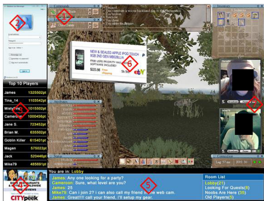
Figure 2. IGIT-modified MMOG screenshot.

advertisement; (5) MMOG specific chat to enable the users in a specific scene to cooperate; (6) In-game 3D UGC. In this example, a user added a note on a tree to publish an eBay auction; (7) two windows of a video chat with casual friends or cooperative players. The choices of which application to use and the applications' screen location are under the control of the user (player).