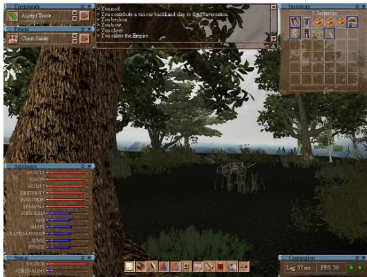
Figure 1. Original MMOG screenshot.