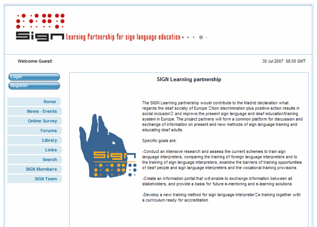
Figure 2: SIGN Learning Partnership Portal

Figure 2 provides an overview of the SIGN portal [6].