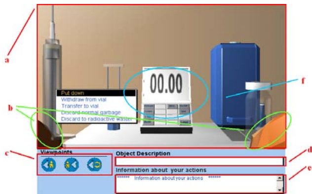
Figure 2. Study mode of the VR Laboratory

Using the buttons of the "viewpoints area" the user can change his/her viewpoint in order to have a different view of the laboratory. The user can choose between four viewpoints: "View behind the avatar", "View in front of the avatar", "View avatar hands" (default viewpoint), "Stand Up" (this viewpoint takes effect only when the avatar is sitting on a seat).