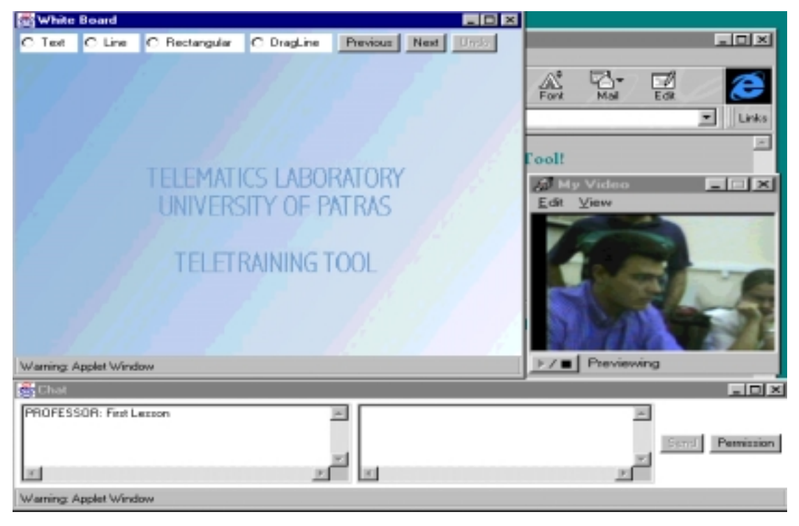
Figure 2. User Interface of the Trainee's Client

Every trainee can access a session using a Web browser in order to run the client's applets. Before that, he should enter the server using his Login and Password which he should have acquired previously by the server.