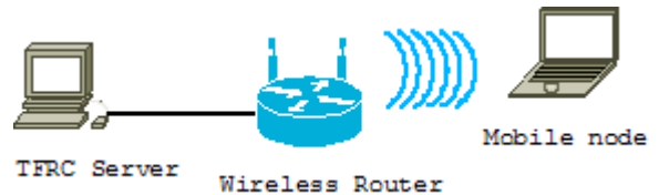
Figure 1: Topology used in experiments

In our experiments we used the network topology illustrated in Figure 1 . The akiyo sample video found in [21] was used for video streaming for the purposes of our experiments.